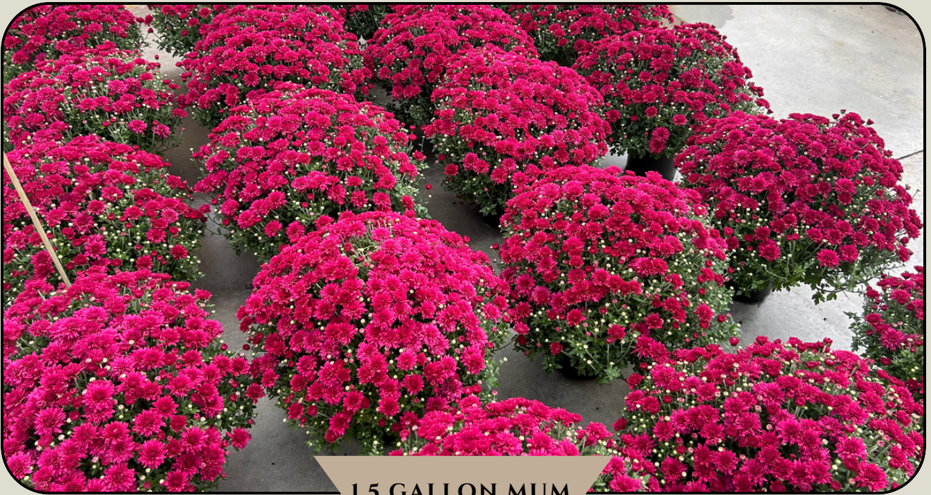
1.5 GALLON MUM